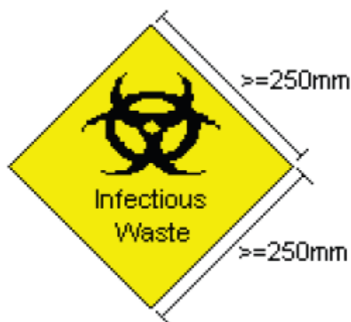
Figure 2 – infectious waste placard